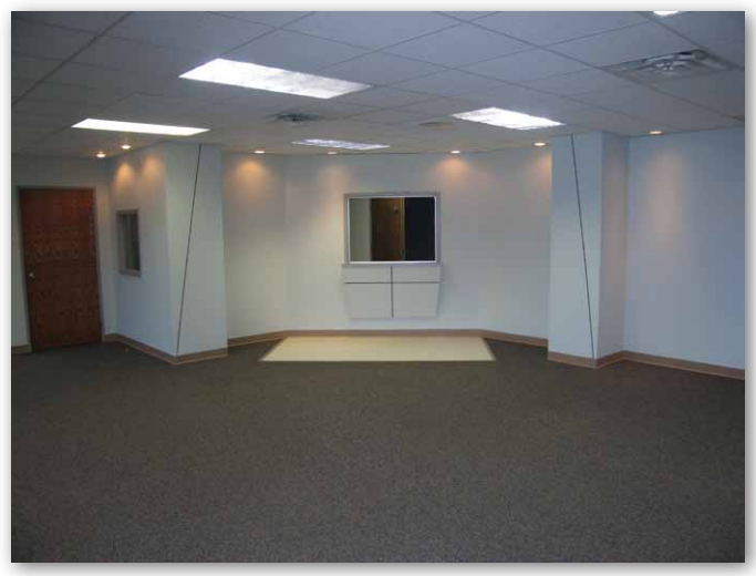
For more listings like this one visit www.hokansoninc.com