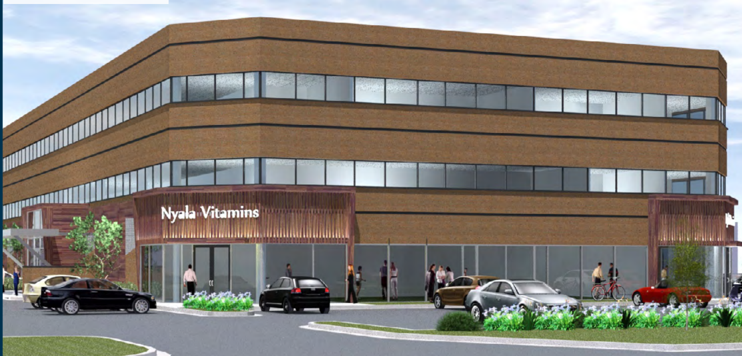
View from Mayfair Road

OWNED / DEVELOPED BY ICA Innovative Capital Advisors