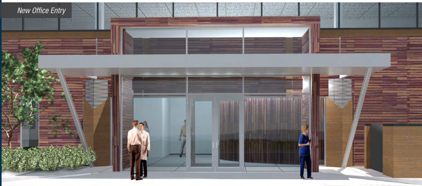
New Office Entry