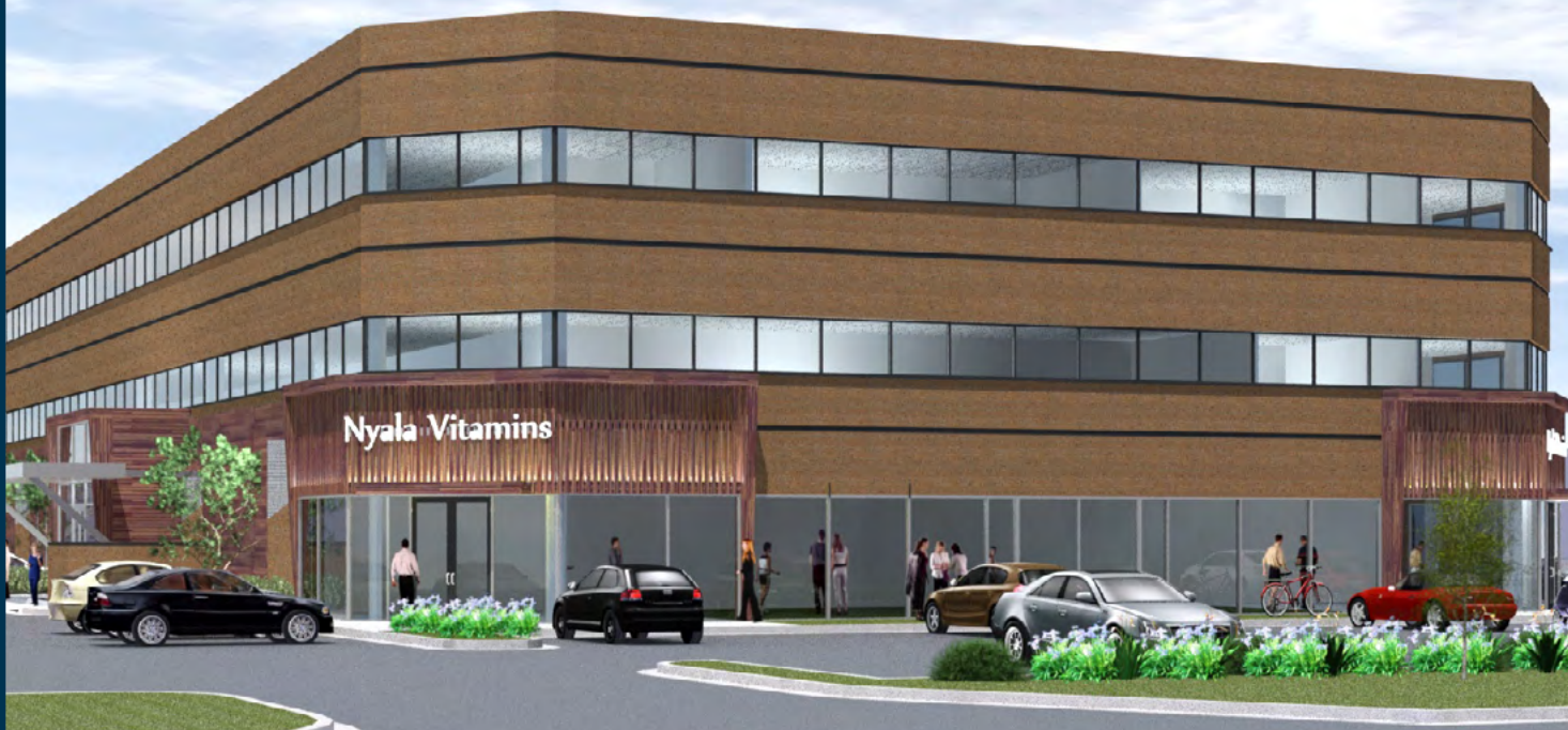
View from Mayfair Road

Redevelopment now underway of prominent office building at the southwest corner of Burleigh Street and Mayfair Road in Wauwatosa, Wisconsin