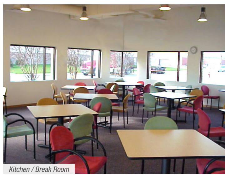
Kitchen / Break Room