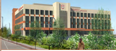
120,000 SF University of Chicago Multi-Specialty Medical Center